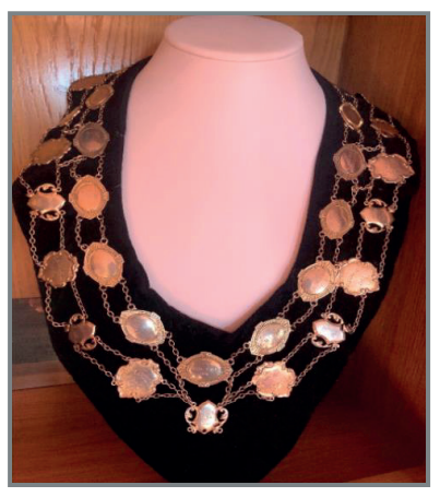
Heanor and Loscoe Town Council Town Mayors Chain of Office