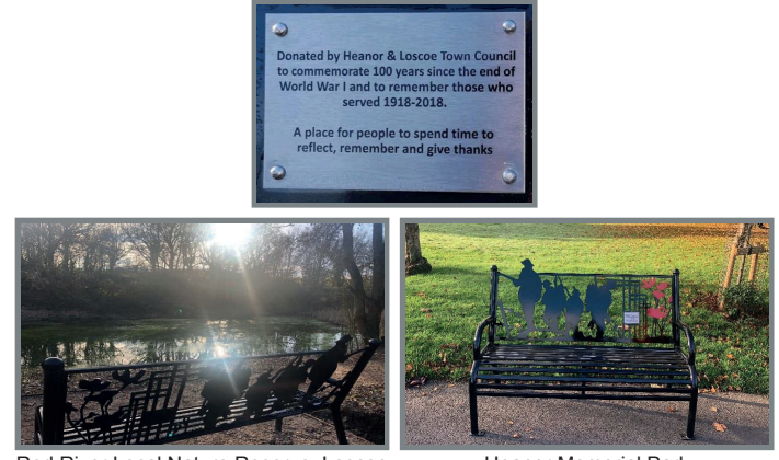
Red River Local Nature Reserve, Loscoe

Heanor & Loscoe Town Council have purchased two World War I memorial benches to commemorate 100 years since the end of World War I. The first bench has been placed in Heanor Memorial Park opposite the War Memorial and the second bench has been placed on the Red River Local Nature Reserve, Loscoe. The benches are a place for people to spend time to reflect, remember and give thanks.