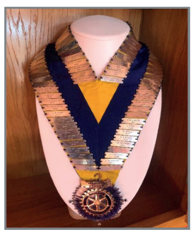
Rotary Club of Heanor Presidential Chain

The Council is committed to saving the Town's Heritage and has a display within the Council Chamber of a number of historic items from local organisations.